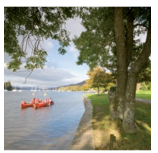
Fell Foot Park