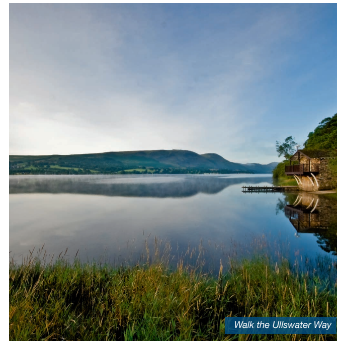
Walk the Ullswater Way

KEY: ① Attractions/points of interest (approx. location) 🚲 Bike Hire - - - - - Walking route