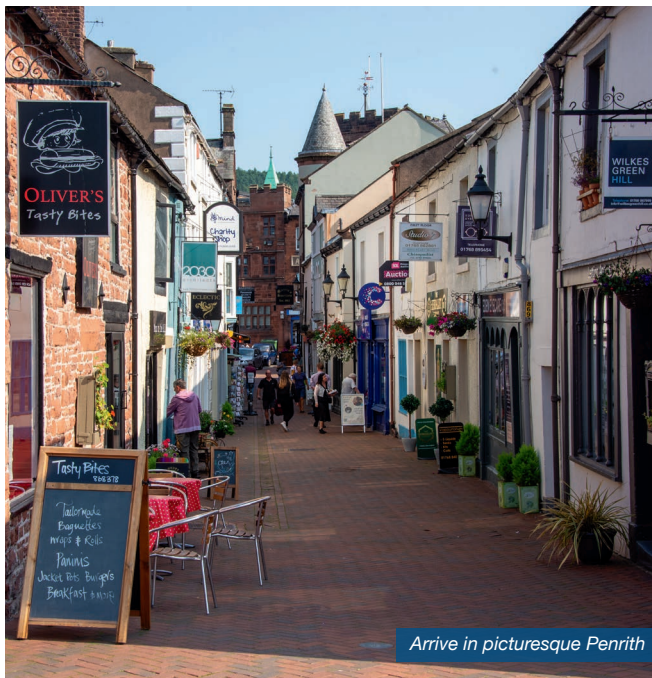
Arrive in picturesque Penrith