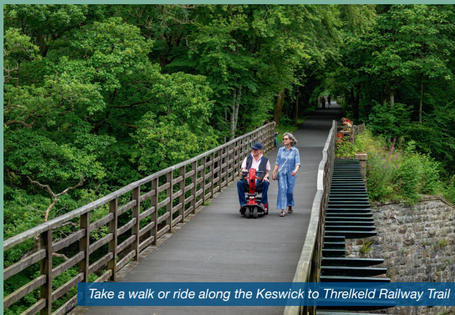
Take a walk or ride along the Keswick to Threlkeld Railway Trail