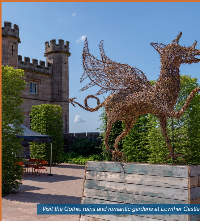
Visit the Gothic ruins and romantic gardens at Lowther Castle

After a few days spent exploring the Lake District by foot, bike, and public transport, it's time to hop on the train or bus and head for home. You can extend your stay and location hop using the Stagecoach bus services if you prefer.