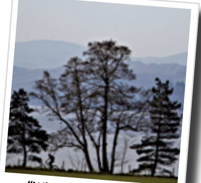
"Without a car we can really get away from it all"

Call traveline on 0871 200 22 33 for public transport info